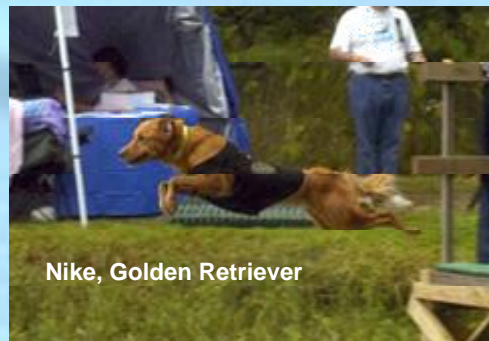
Nike, Golden Retriever

Speed Retrieve is where dogs are timed on how fast they can run down the dock, jump into the water, and retrieve the toy.