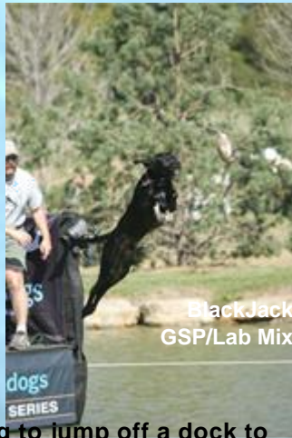
BlackJack GSP/Lab Mix

The Chicagoland DockDogs Club formed in January of 2005. Its purpose: to bring together people who love the sport of dock jumping. As an affiliated club of DockDogs Worldwide, Chicagoland DockDogs hosts regional jumps, monthly practices, conducts practices indoors and out and offers support for all dog/handler teams interested in the sport. DockDogs competitions are open to all breeds of dogs, all ages & sizes. If your dog loves the water, loves to retrieve, and is willing to jump off a dock to get his/her toy, then this is the sport for you. No formal training is needed, but a good sit, stay and come when called are very important. Chicagoland DockDogs continues to grow each year by adding new members and events to the calendar.